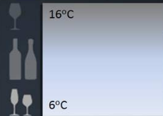
Temperature 6°C - 16°C