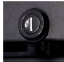
Equipped with Lock