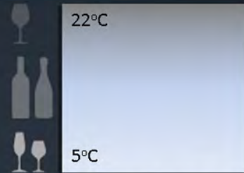
Temperature 5°C - 22°C